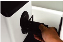
▲ Liquid/ Sheet Material Fixture