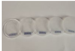
▲ Haze Standards