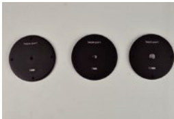
▲ Custom Made Apertures