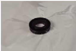
▲ Soft Film Fixture